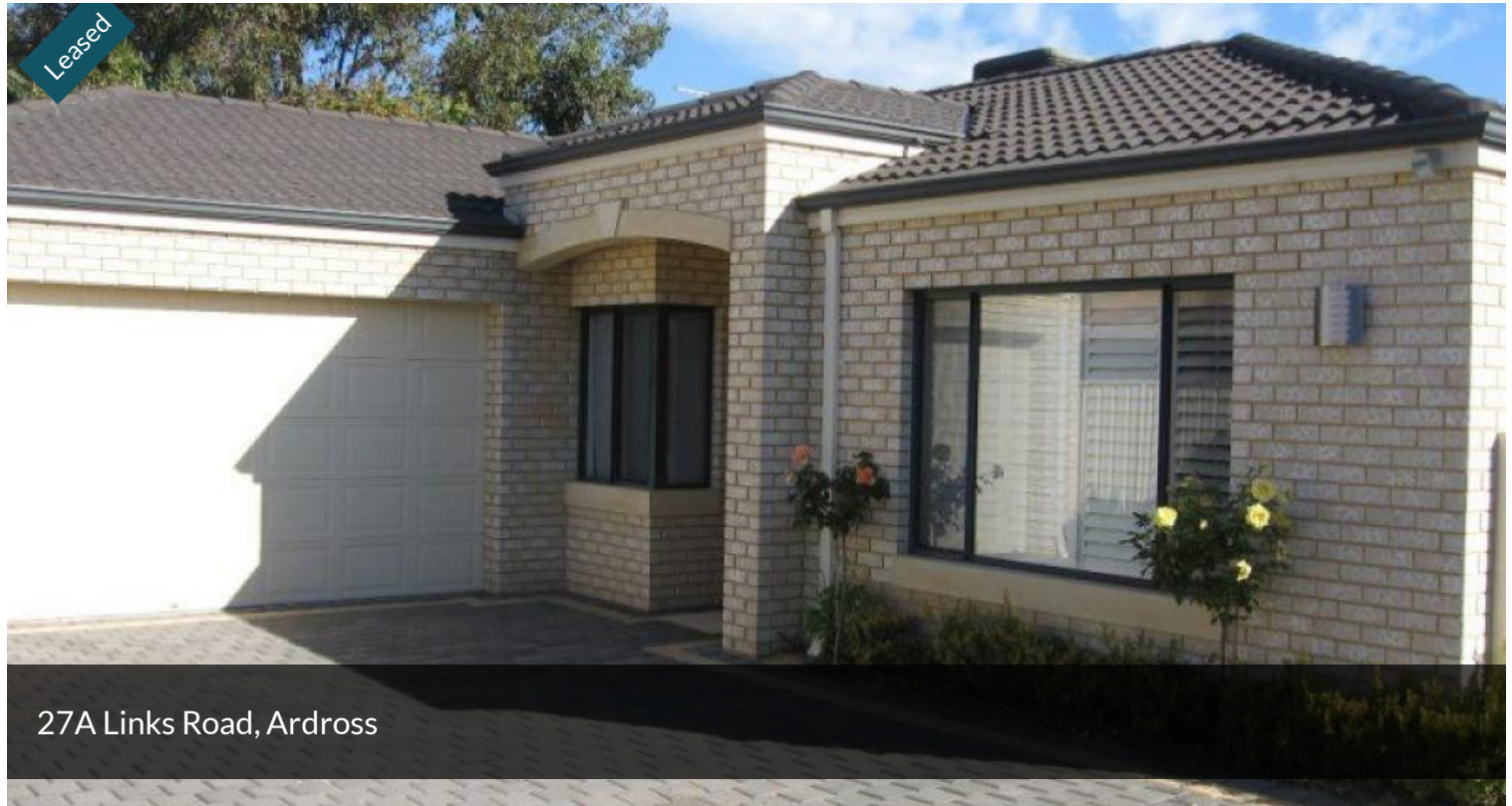
27A Links Road, Ardross