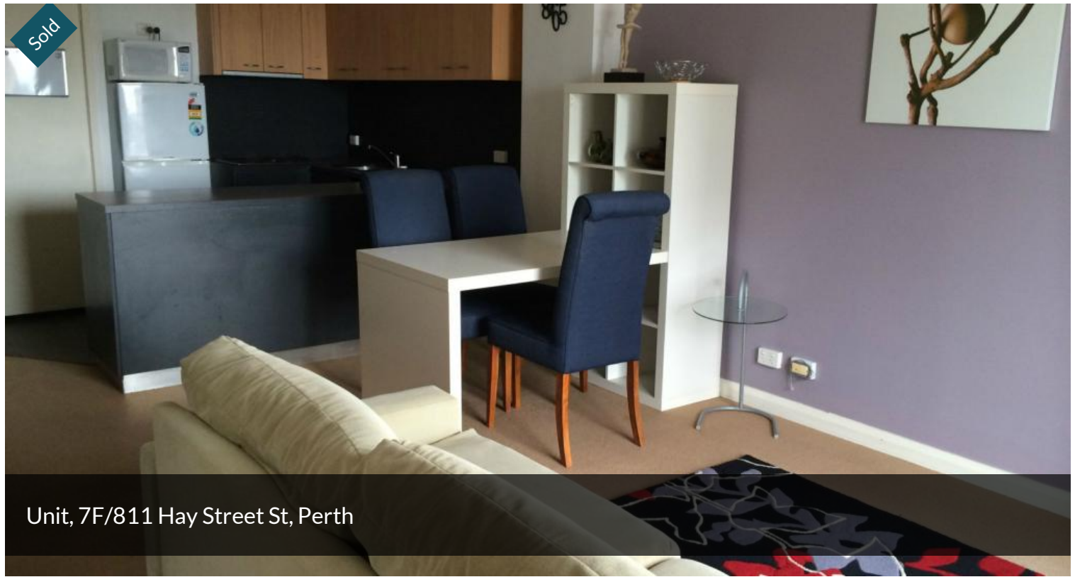
Unit, 7F/811 Hay Street St, Perth