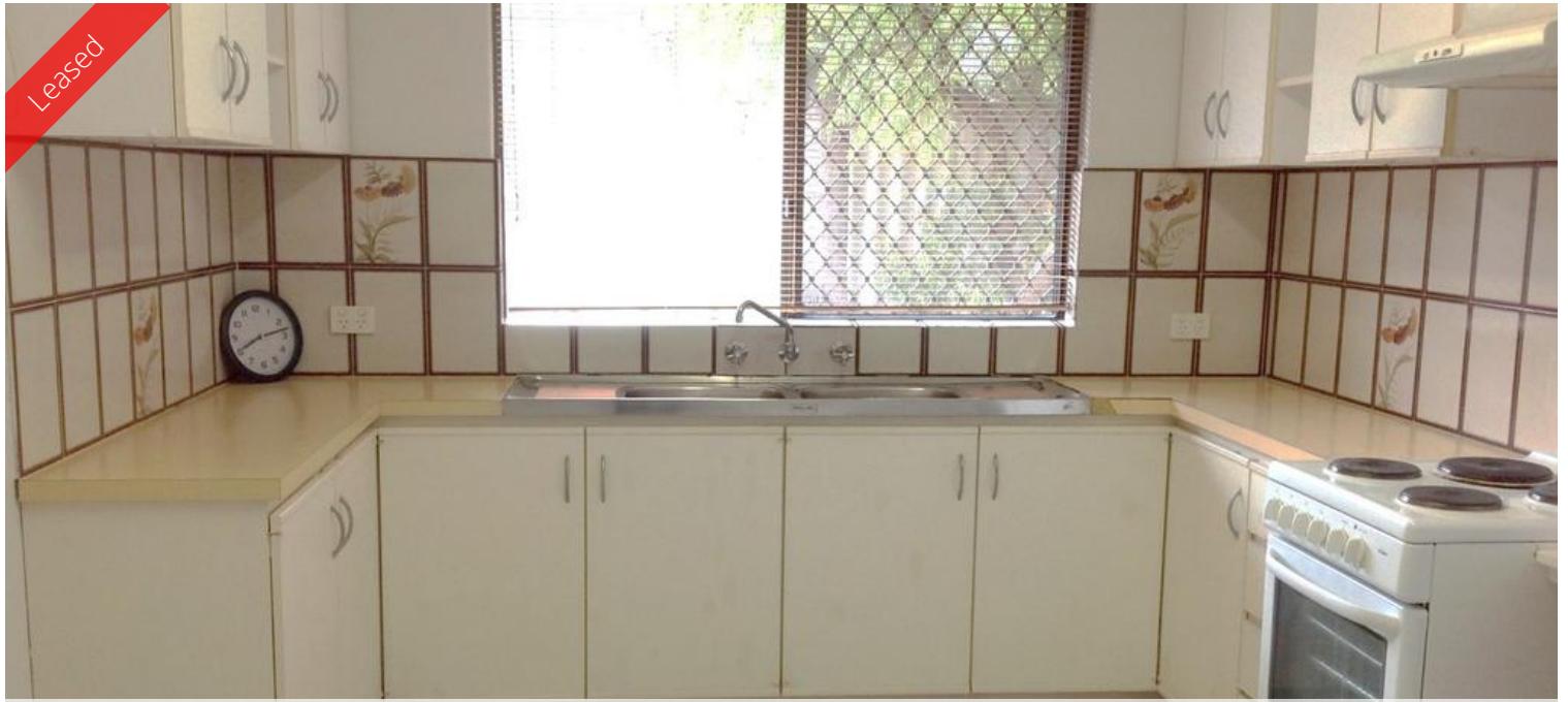
Unit 5, 110 Main St, Osborne Park