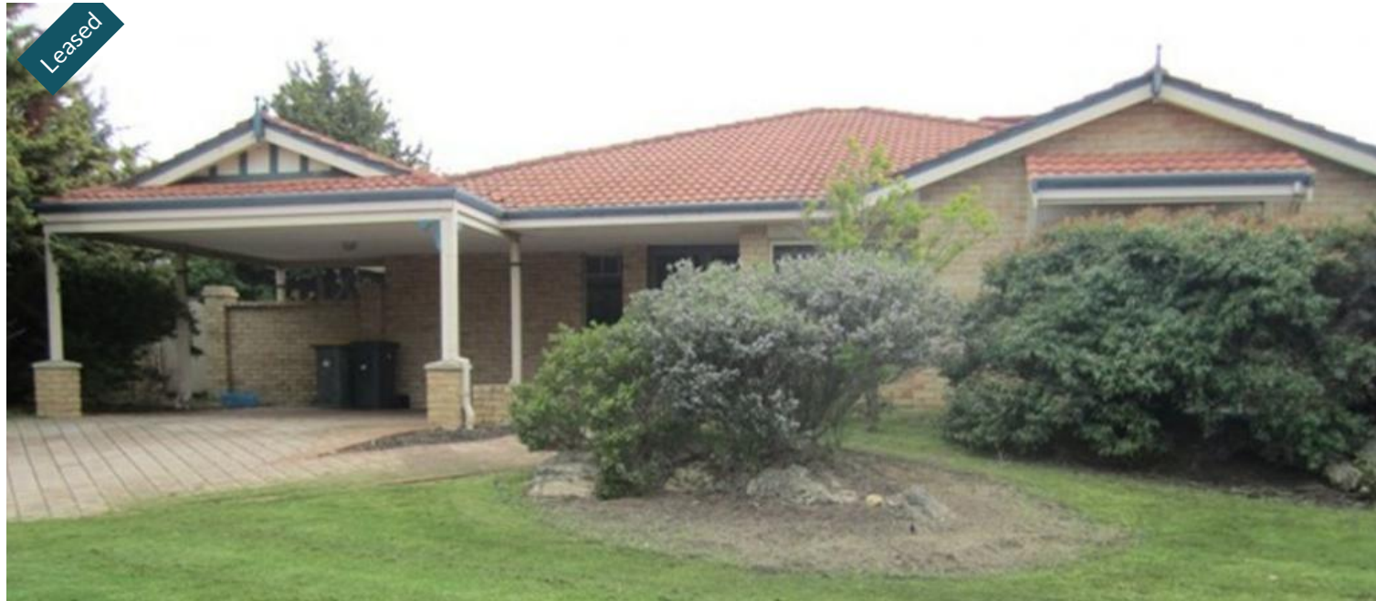
12 Seamill Glen, Kinross