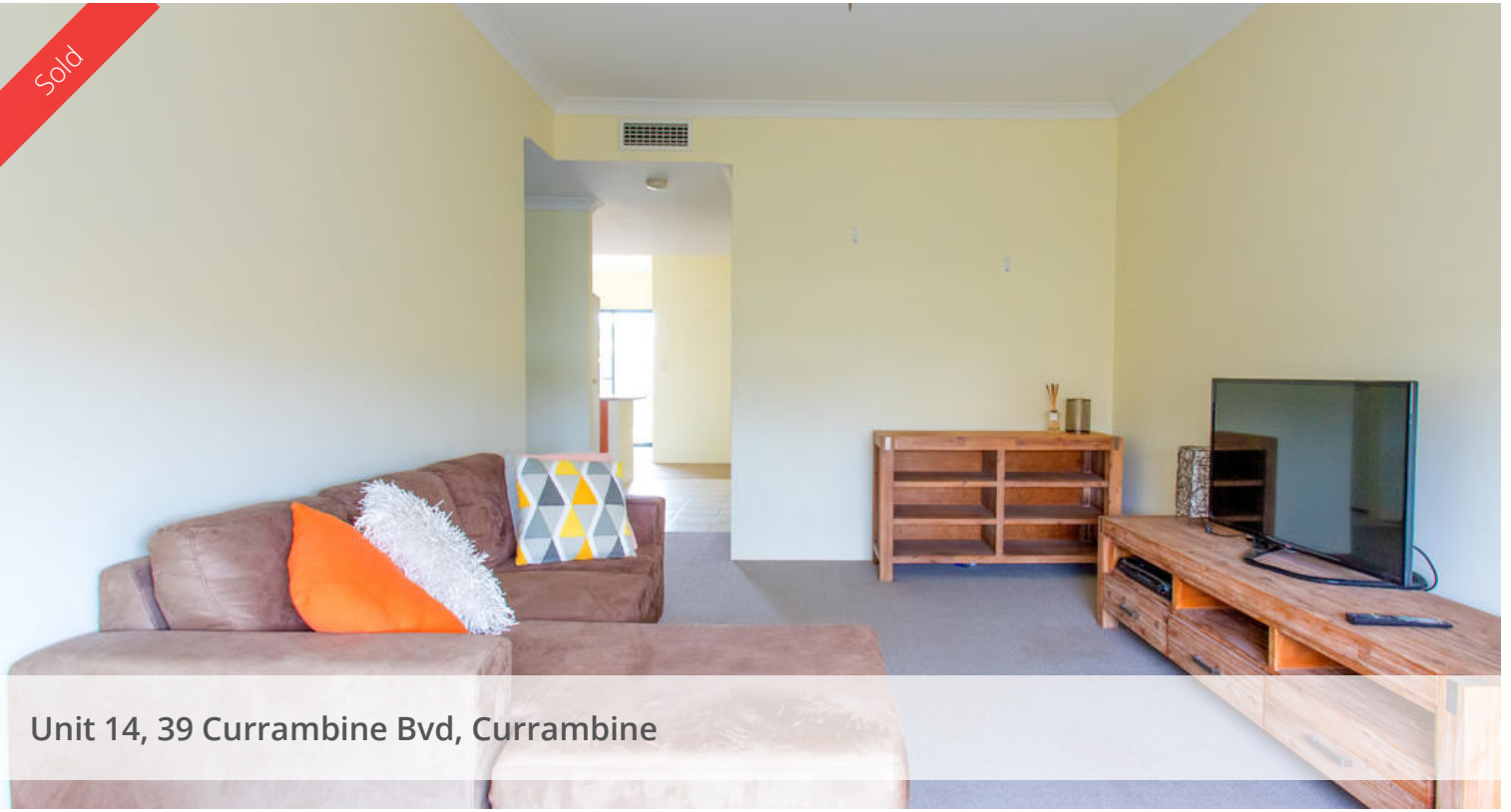
Unit 14, 39 Currambine Bvd, Currambine