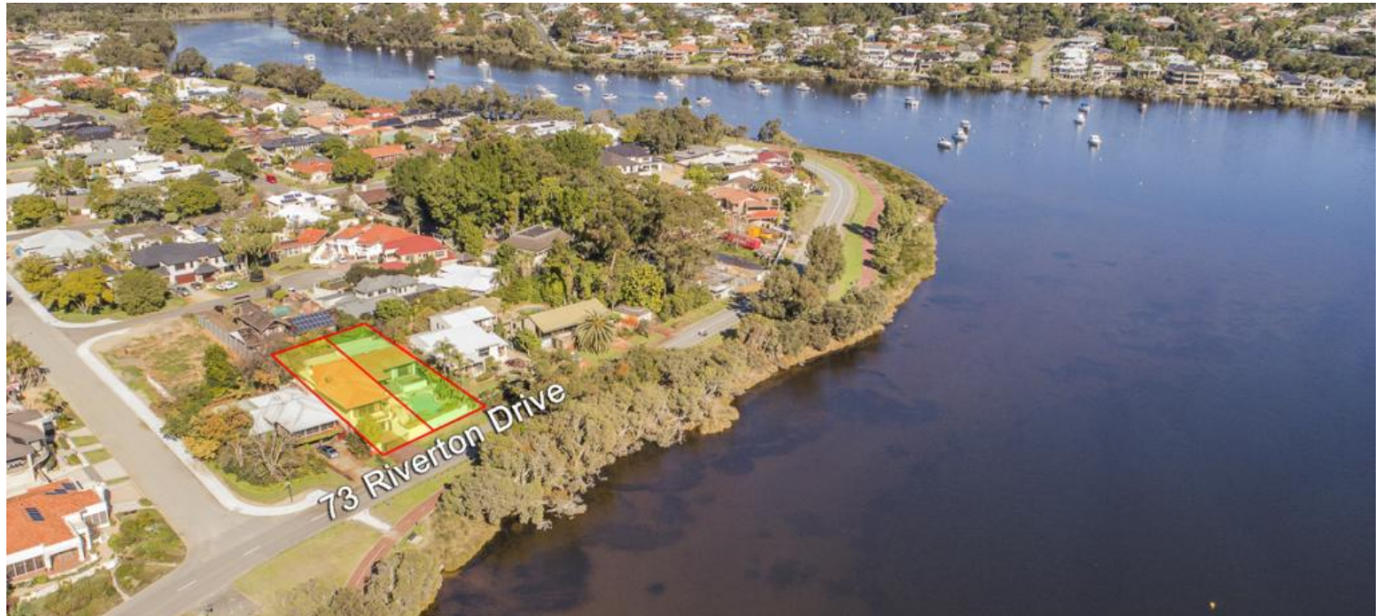
73B Riverton Drive West, Rossmoyne