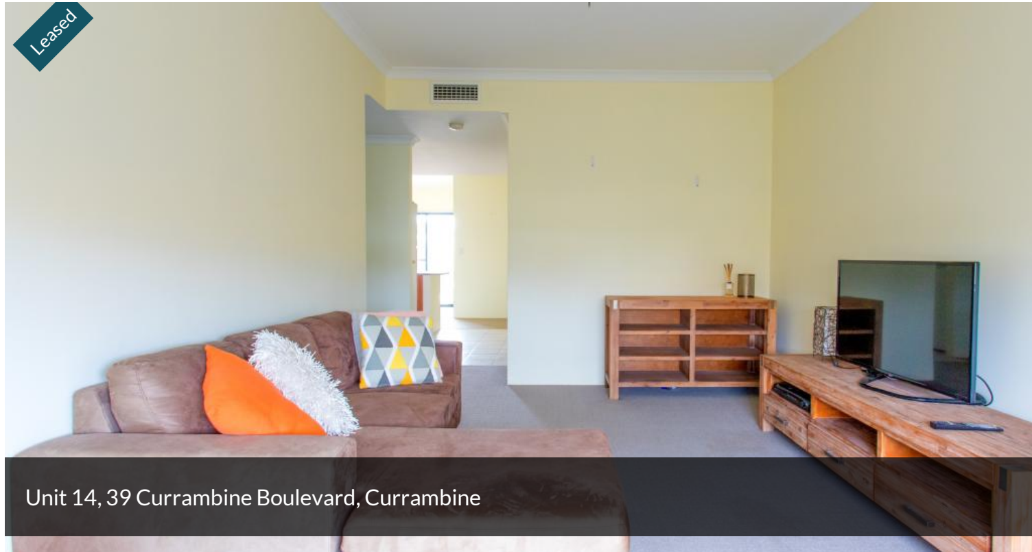
Unit 14, 39 Currambine Boulevard, Currambine